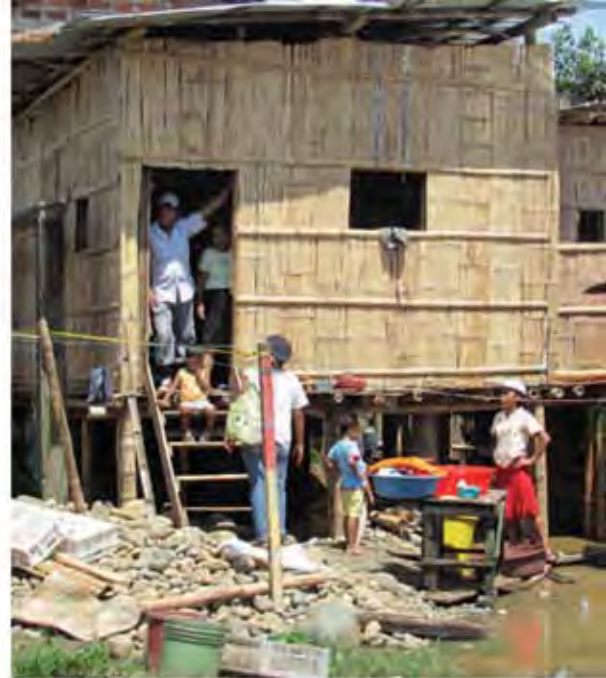
La Poza, a small ghetto of bamboo huts built on stilts and connected by narrow bridges made of wooden boards