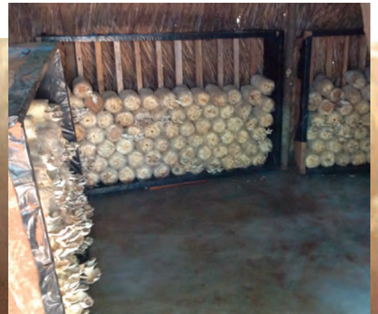
Cultivating oyster mushrooms.

The house has ventured into different farming methods, including animal farm production. Currently, the formation house has 32 pigs, 28 goats, 11 fowl and two sheep. The house also has started cultivating oyster mushrooms. The seminarians' participation has been superb. They have learned the process well and are poised to produce more and more. In addition, the house has begun to produce liquid soap. This was an idea brought up by a seminarian who knew the soap-making procedure and was able to teach the others. The house now produces liquid soap for hands as well as dish washing.