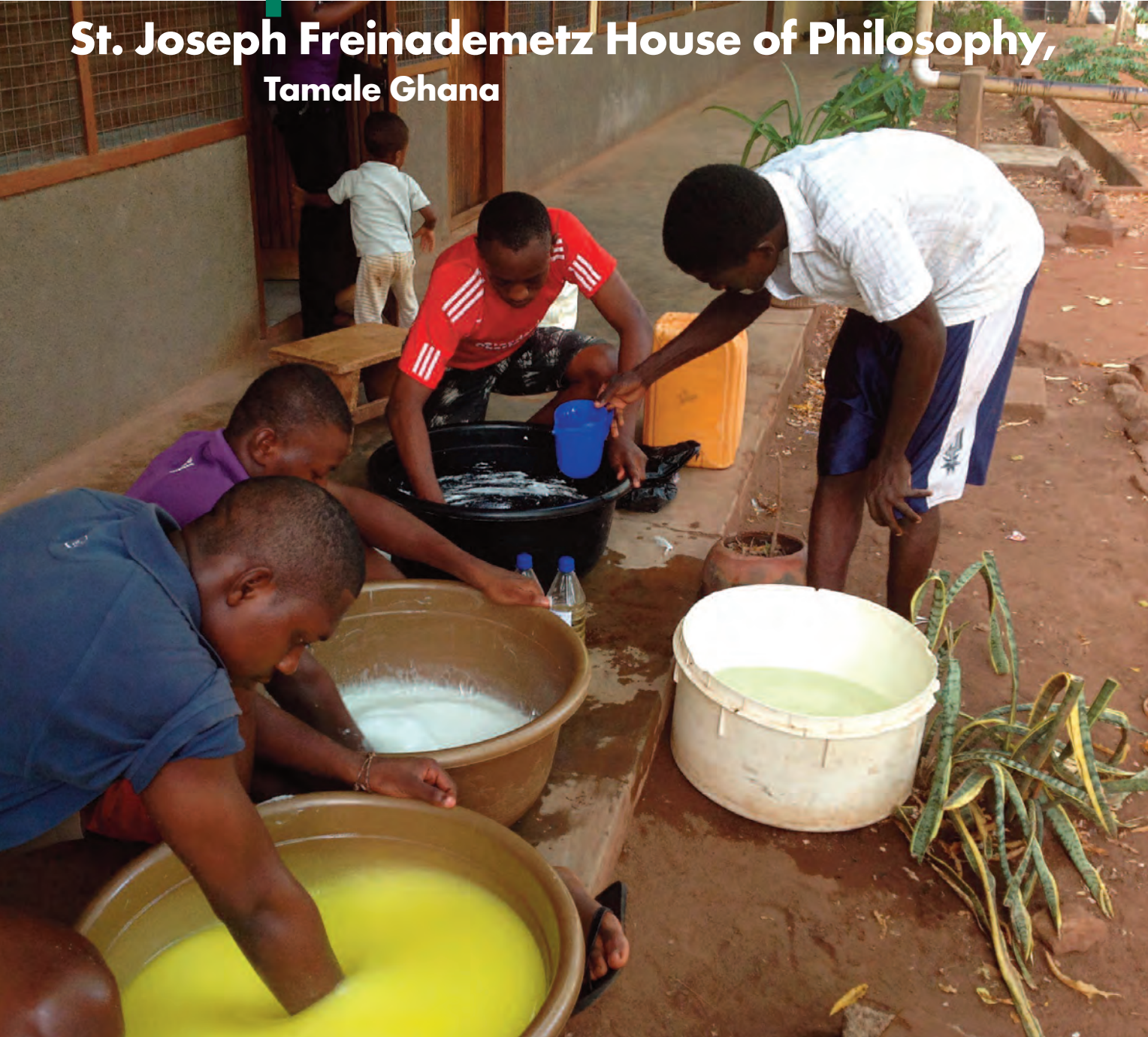
Producing liquid soap for washing hands and dishes.

St. Joseph Freinademetz House of Philosophy, Tamale Ghana